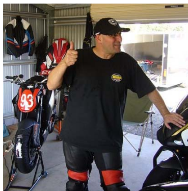
Thumbs up from Dean