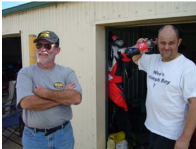
Hello, anyone there?