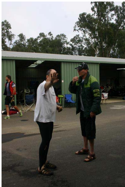
No photos please, and no I'm not Triumph Boy.