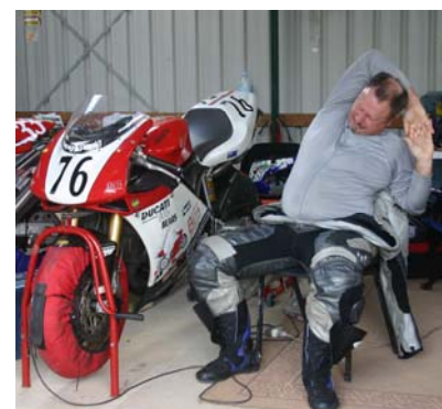
The Prez warms up ready for the first round of the national series at Broadford