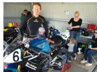
Peaky was on fire taking out F2 for the weekend.