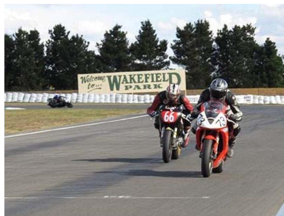
Goose wishes the db1 had more stick, Westy wishes Goose would piss off!